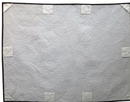
View of back of artwork